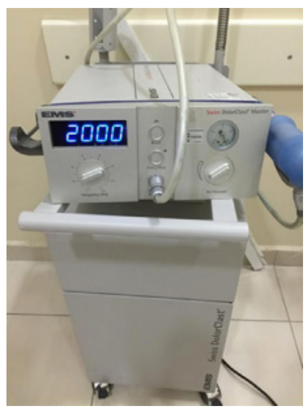
Figure 3. ESWT device.