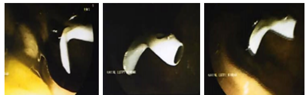
Figure 4. Stent visualized in the choledoch and black bile flow.