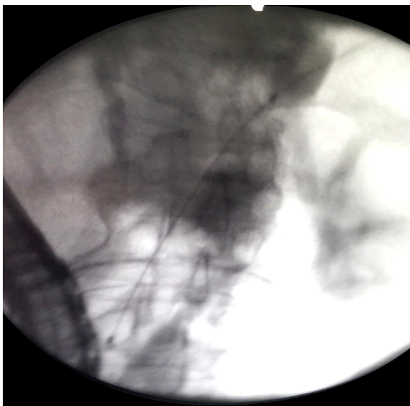
Figure 2. Fluoroscopic view of the guidewire as seen during the endoscopic retrograde cholangiopancreatography procedure.