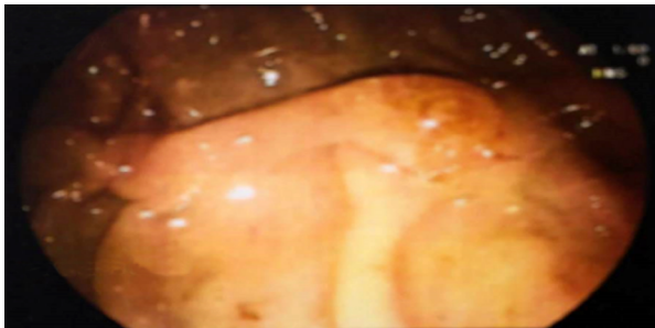
Figure 1. Front view of the papilla as seen during the endoscopic retrograde cholangiopancreatography procedure.

ERCP was initiated with the patient in the left lateral decubitus position. When the duodenoscope had passed the pylorus, the patient was placed in the prone position. The second part of the duodenum had been reached, the big wheel of the device was turned counterclockwise and the small wheel was turned clockwise to ensure proper positioning in front of the papilla, but resistance was encountered. The small wheel was adjusted counterclockwise and the big wheel clockwise to achieve an optimal view and positioning in front of the papilla (Fig. 1). Next, the choledoch was selectively cannulated. A guidewire was placed into choledoch at the 1 o'clock position, rather than the standard 11 o'clock location (Fig. 2). Once the bile duct had been successfully located, cholangiography was performed. The region distal to the choledoch was mildly dilated. The contrast did not extend more than 1–1.5 cm above the papilla and stenosis was observed (Fig. 3) After a 5-mm sphincterotomy, a 10-F Amsterdam-type plastic