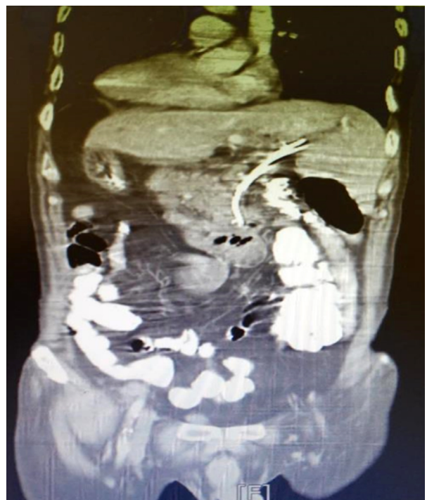
Figure 5. Computed tomography image of the stent in the common bile duct after the endoscopic retrograde cholangiopancreatography procedure.