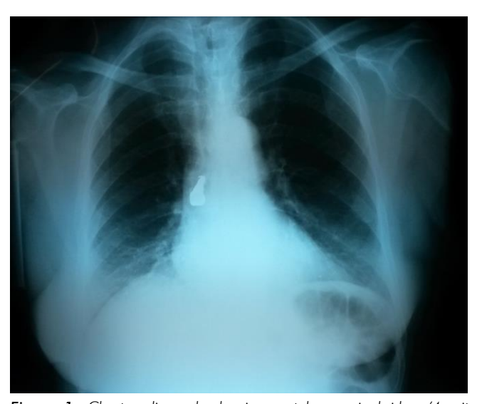
Figure 1: Chest radiograph showing metal ceramic bridge (4-unit crowns) lodged in the right mainstream bronchus (anteroposterior view of X-ray)

Auscultation differences between respiration of both lungs and ABG analysis indicate radiographic imaging of the lung under suspicion for acute obstruction of respiratory tract. After chest radiography, the radiologist described MFB in the right bronchus and soft transparency difference between the left and right lung (Figure 1).