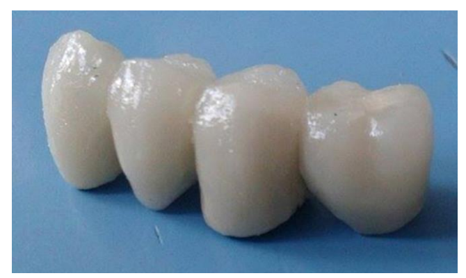
Figure 4: Retrieved aspirated metal ceramic bridge