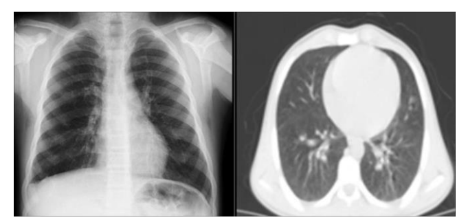
Figure 5: Fiberoptic bronchoscopy revealed diffuse airway erythema and bleeding

Herpes simplex infections are very common in the human population. HSV-1 causes a variety of infections that involve mucocutaneous surfaces, the central nervous system, and occasionally visceral organs such as the lungs (2,3). HSV-2 mostly causes Herpes genitalis, and at the same time may be recognized in 10% to 20% of cases in Herpes labialis (4). Primary HSV infections are seen usually in the upper respiratory system as gingivostomatitis or pharyngitis. Some viruses of the herpes virus family, such as HSV (e.g.: types 1, 2, 6, and 8), Varicella zoster, and CMV can cause pneumonia (5).