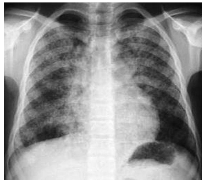
Figure 1: Initial chest x-ray showed bilateral alveolar infiltrates