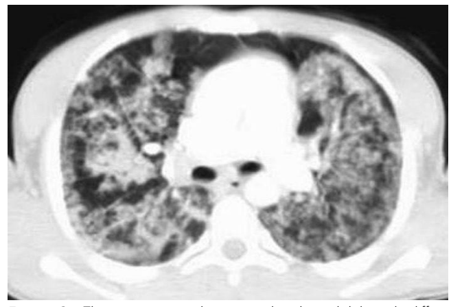
Figure 2: Thoracic computed tomography showed bilateral, diffuse ground glass opacities and interlobular septal thickening