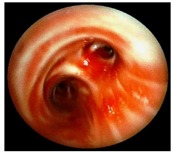
Figure 3: Fiberoptic bronchoscopy revealed diffuse airway erythema and bleeding