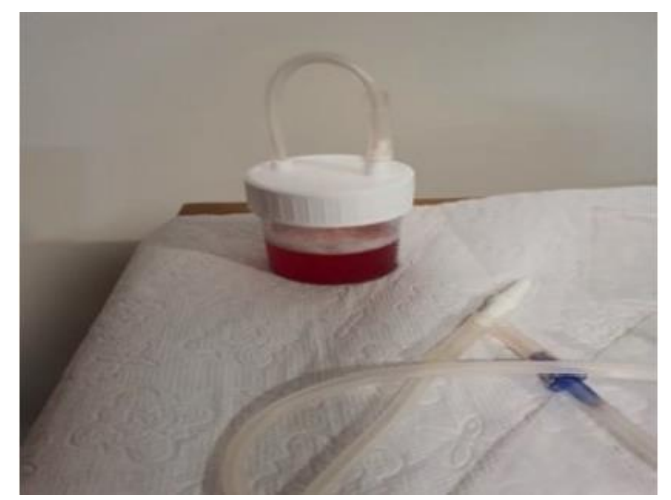
Figure 2: The patient's bronchial lavage fluid sample obtained through fiberoptic bronchoscopy