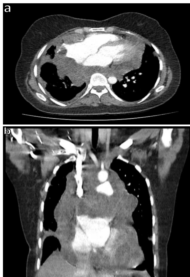
Figure 1a and b: Cystic lesion in the mediastinum on a contrast-enhanced thorax CT of the case, axial section (a), Cystic lesion in the mediastinum on a contrast-enhanced thorax CT of the case, coronal section (b)

The case was evaluated by a multidisciplinary council of thoracic and cardiovascular surgeons, and was considered inoperable due to the potential for morbidity and even mortality with the excision of the cysts, which were common to all cavities of the heart. Furthermore, the cardiac cyst of the patient, whose pericardium was opened in the previous operation, could not be excised due to extensive adhesions, and the possibility of experiencing the same problem in a further operation was evaluated as strong. Close follow-up was continued with intermittent albendazole treatment based on LFT results. The patient's tachypnea and dyspnea continued during follow-up, and the albendazole treatment was discontinued and restarted intermittently based on LFT results, as a partial relief of symptoms was noted under albendazole therapy.