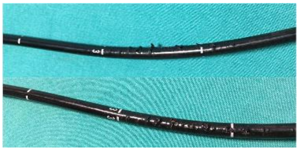
Figure 1: Surface tears on the bronchoscope

reason for this damage could not be understood. On the following day, endoscopic examination of the nose was performed by members of the Ear, Nose and Throat Clinic and in the left posterior nasal cavity, a horizontal septal spur of nasal deviation obstructing the nasal passage was determined (Figure 2).