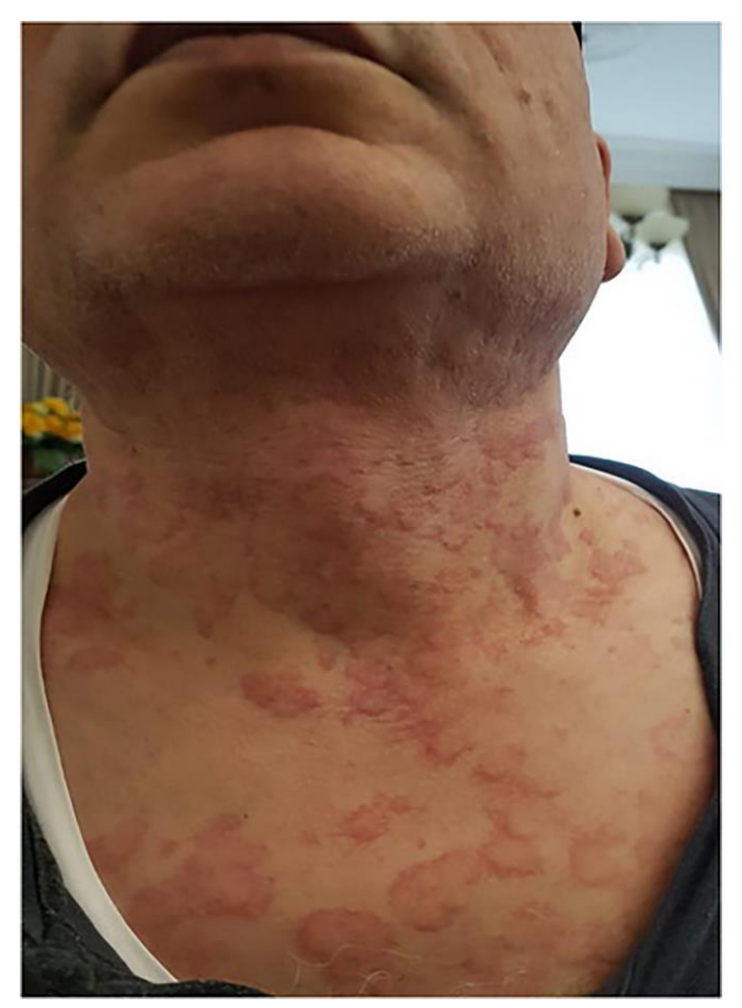
Figure 1: Skin lesion at neck region