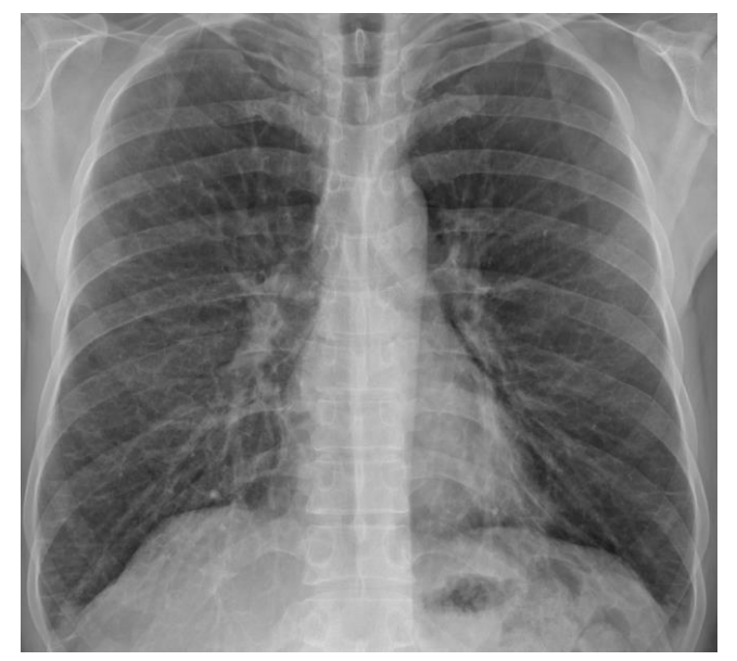
Figure 3: Chest X-ray of the patient