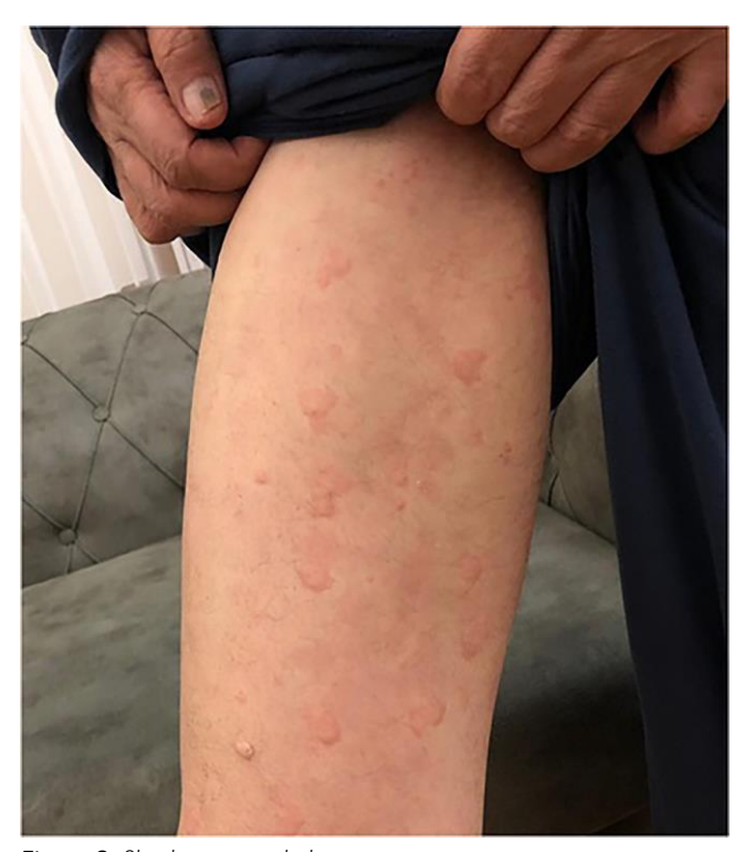
Figure 2: Skin lesion at right leg