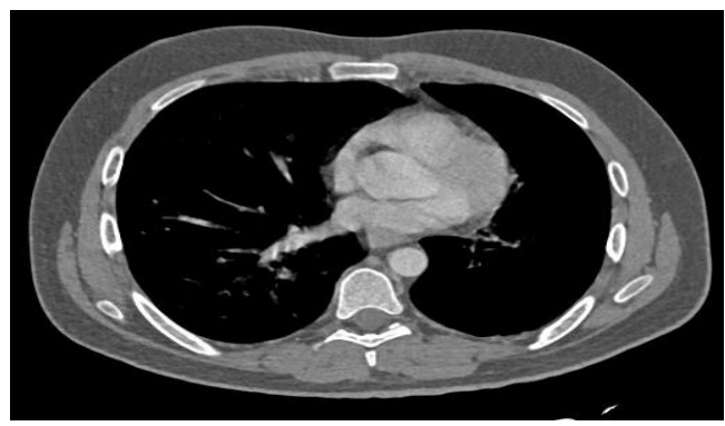
Figure 2: The pulmonary vessel and sub-branches were hypoplasic; there was a marked decrease in vascular branching