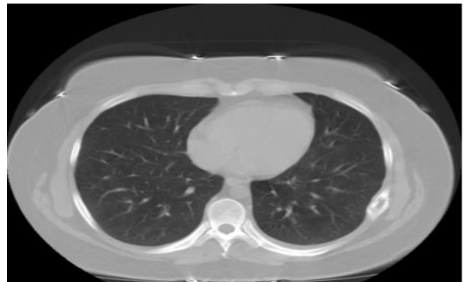
Figure 2: A destructive osteolytic lesion on the left 7th rib was noted

The clinical patterns of LCH are varied, and may affect single regions or different organs, being known to affect bone, lung, liver, central nervous system, thymus, lymph node and skin (1). Single solitary lesions on the rib, however, are extremely rare, with few studies reporting cases of this nature (3,4). Although its clinical pattern may be varied, there is a strong tendency for the formation of an osteolytic lesion on the bone. Differential diagnoses of osteolytic lesions must consider multiple myeloma, primary bone malignancy, lymphoma, metastasis and osteomyelitis, and LCH also should be considered in the differential diagnosis of osteolytic lesions occurring in the rib.