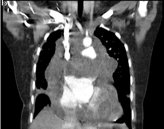
Figure 1a and b: Cystic lesion in the mediastinum on a contrastenhanced thorax CT of the case, axial section (a), Cystic lesion in the mediastinum on a contrast-enhanced thorax CT of the case, coronal section (b)