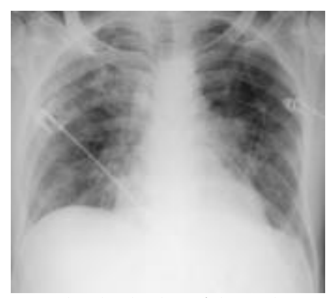
Figure 1: Chest radiography at the time of admission to the intensive care unit