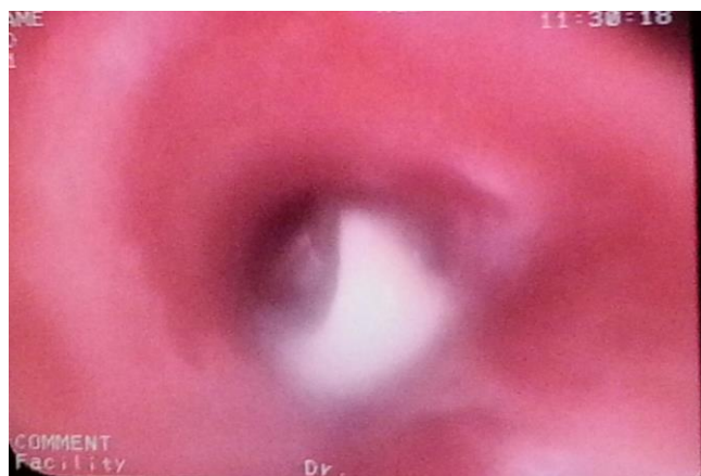
Figure 3: In fiberoptic bronchoscopy, a foreign body was identified in the proximal part of the right lower bronchus

The most important factors in diagnosis are a detailed anamnesis, respiratory system examination, and the accurate localization of the foreign body with the help of radiological methods. Chest x-rays taken from two positions prior to bronchoscopy generally show the accurate localization of the foreign body (4). When TFBA (Traumatic Foreign Body Aspiration) is suspected, radiological imaging techniques should be used. If the foreign body is radiopaque, it can easily be detected by posteroanterior chest x-rays. However, in order to correctly locate and determine the size of the foreign body, lateral and oblique chest x-rays should also be taken, and if required, thoracic computed tomography should also be obtained (5). Although a normal chest x-ray does not rule out foreign bodies, if the clinical suspicion remains, a bronchoscopic examination is inevitable. In our case, the diagnosis was made with chest x-ray and thoracic computed tomography.