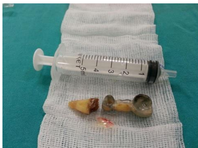
Figure 4: The dental prosthesis and its tooth removed

The most contemporary treatment method for tracheo-bronchial foreign body aspirations is the removal of the foreign body by rigid bronchoscopy under general anesthesia. It is emphasized that all cases with a history of TFBA should undergo bronchoscopy; however, in order to prevent morbidity from foreign body aspirations that may be overlooked, some negative consequences are inevitable, but with sufficient experience and suitable patient selection, the success rate of FOB in TFBA is high (6,7). As the patient had a tracheostomy, the foreign body was removed successfully by fiberoptic bronchoscopy.