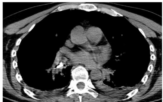
Figure 2: Right lower lobe atelectasis and also a foreign body at the entrance of right lower lobe was seen at posteroanterior thoracic computed tomography

Chronic debilitating symptoms with recurrent infections might occur with delayed extraction, or the patient may remain asymptomatic. The actual aspiration event can usually be identified, although often it is not immediately recognized. The aspirated object might even escape detection. Most frequently, the aspirated object is food, but a broad spectrum of aspirated items has been documented over the years. Commonly retrieved objects include seeds, nuts, bone fragments, nails, small toys, coins, pins,