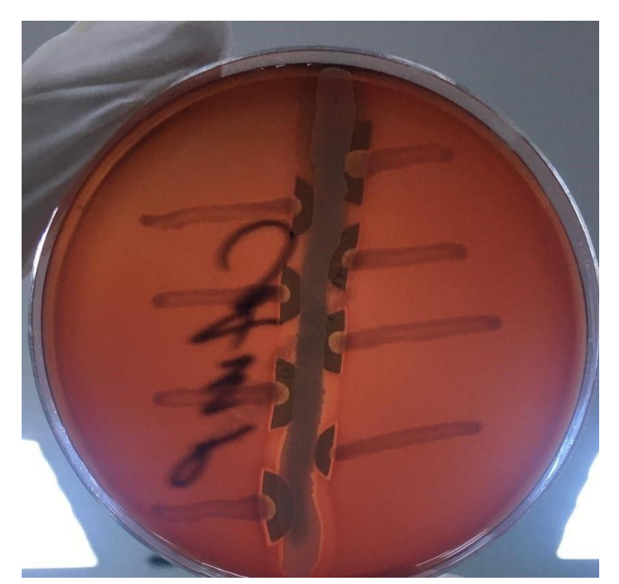
Figure 4: CAMP test of the microorganism

manifestation of pulmonary infection, occurring through the bloodstream, and extrapulmonary relapse is usually seen in the central nervous system in the form of brain abscess or meningitis. It can also cause extrapulmonary infections such as wound infections, subcutaneous abscesses, pericarditis, osteomyelitis, cervical adenopathy, endophthalmitis, lymphangitis and mastoiditis (17). The medical history of the presented case included a diagnosis of diabetes mellitus, being a disease that suppresses the immune system, and the use of immunosuppressive drugs following a kidney transplantation. The patient had both cavitary pneumonia and extrapulmonary bacteremia. The microorganism is phagocytosed by alveolar macrophages, and macrophages continue to grow in it, leading to a granulomatous inflammatory reaction and the subsequent development of necrosis. Pneumonia can start without symptoms and may be overlooked, especially in immunosuppressed patients. Often, symptoms such as weight loss, cachexia, pleuritic chest and pain accompanied by fatigue, fever and cough are observed (9). R. equi can also be isolated in blood cultures due to the bacteremia in pulmonary infections. Bacteremia has been observed at a rate of 10% in immunocompetent patients and 25% in HIV-infected solid organ transplant recipients (15, 17).