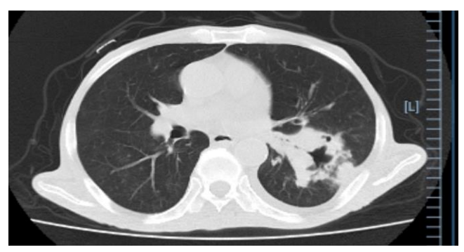
Figure 1: Cavitary lesion in the lower lobe superior segment of the left lung

A 69-year-old male patient who had undergone a kidney transplant 7 years earlier due to diabetic nephropathy, and who had been in contact with such animals as cattle, was admitted to an another hospital with complaints of weight loss, cough and hemoptysis that had started 6 months earlier. A computed tomography of the thorax revealed a cavitary lesion in the lower lobe superior seqment of the left lung (Figure 1). BAL EZN (Ehrlich-Ziehl-Neelsen) staining was negative for AFB (acid fast basil). To investigate whether the cavitation was due to malignancy, a PET-CT (positron emission tomographycomputed tomography) was performed, and in the cavity was intensely FDG avid (SUVmax 5.6), while no FDG uptake was present elsewhere. A transthoracic biopsy was then performed but was non-diagnostic, and the patient refused a repeat biopsy.