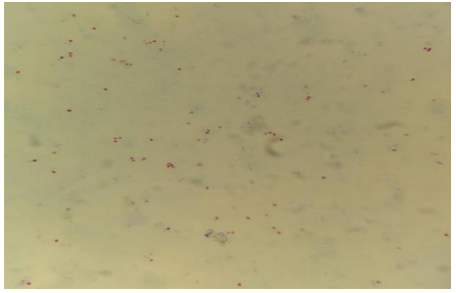
Figure 2: Partial acid-resistant coccobacillus in the EZN staining