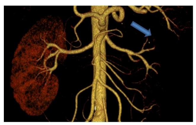
Figure 3: In the segmental arteries of the left kidney, a pruned tree view (arrow) can be seen in the CT angiography image created using the volume rendering technique