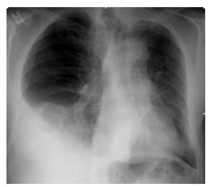
Figure 2 The x-ray showing a right-sided pleural effusion.