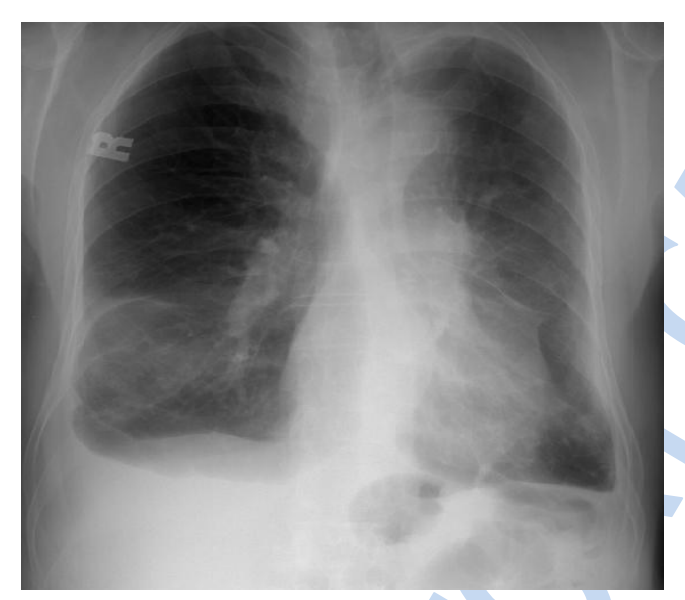
Figure 3: The x-ray showing regressed right-sided pleural effusion.