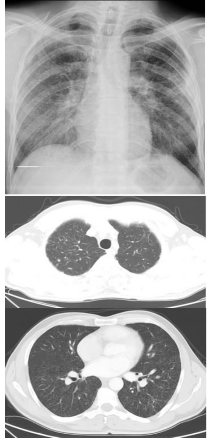
Figure 2: Chest X-ray and Thorax CT After Cessation of Smoking

LCH is a prominent disease in pulmonary medicine given its prevalence among young adults with a history of smoking and its presentation with isolated pulmonary involvement. The incidence of the disease is very rare, and its co-existence with various malignancies has been reported. Retrospective studies have suggested that the risk of acute myeloid leukemia is increased in cases with LCH (9). Thus, the risk of secondary malignancies should be considered during follow-up.