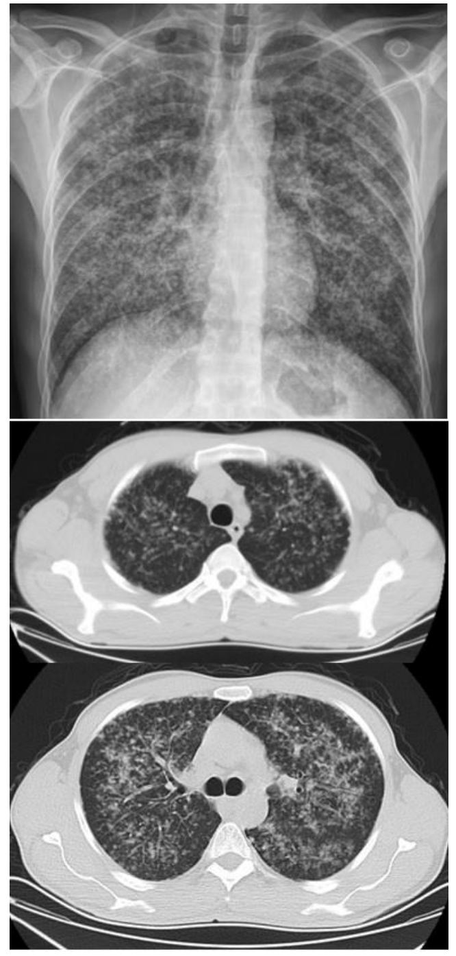
Figure 1: Chest X-ray and Thorax CT at Admission