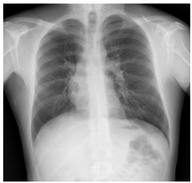
Figure 1: Posteroanterior Chest X-ray of the patient

A 23 year-old-male member of the military applied for a periodical physical examination. A chest X-ray revealed left hilar enlargement and a reduction in volume of the right lung (Figure 1), and the patient was subsequently evaluated with contrasted computerized tomography (CT). A thorax CT scan (Figure 2 and 3) revealed normal volume in the right lung, although the right lower lobe was supplied with blood from the celiac artery. The patient was a non-smoker, asymptomatic and healthy, with no self-reported history of lower respiratory tract infection or hemoptysis, and the rest of his medical history was insignificant. A congenital bronchopulmonary vascular malformation diagnosis of bronchopulmonary sequestration Pryce Type I or pseudosequestration was made, and the patient was advised to seek treatment in the event of the development of pulmonary symptoms.