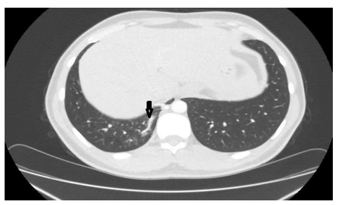
Figure 2: CT scan of the patient