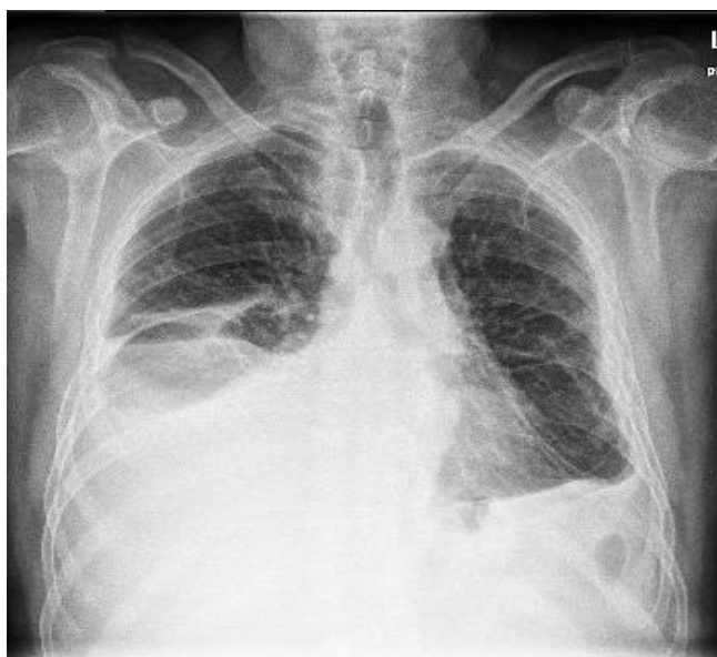
Figure 2: CXR December 2017, Right pleural effusion

The diagnosis of MPM currently requires pathological examination and immunohistochemical analyses that are supplemented with radiological examination, such as chest X-rays and CT scans. Pathological confirmation can either be achieved by cytological examination of the pleural fluid, or more commonly, via an invasive surgical biopsy (3). Biomarkers, such as soluble mesothelin, osteopontin, and fibulin-3, have been investigated for their diagnostic potential in MPM. However, these do not have sufficient sensitivity and specificity to be stand-alone markers and require additional validation studies (4).