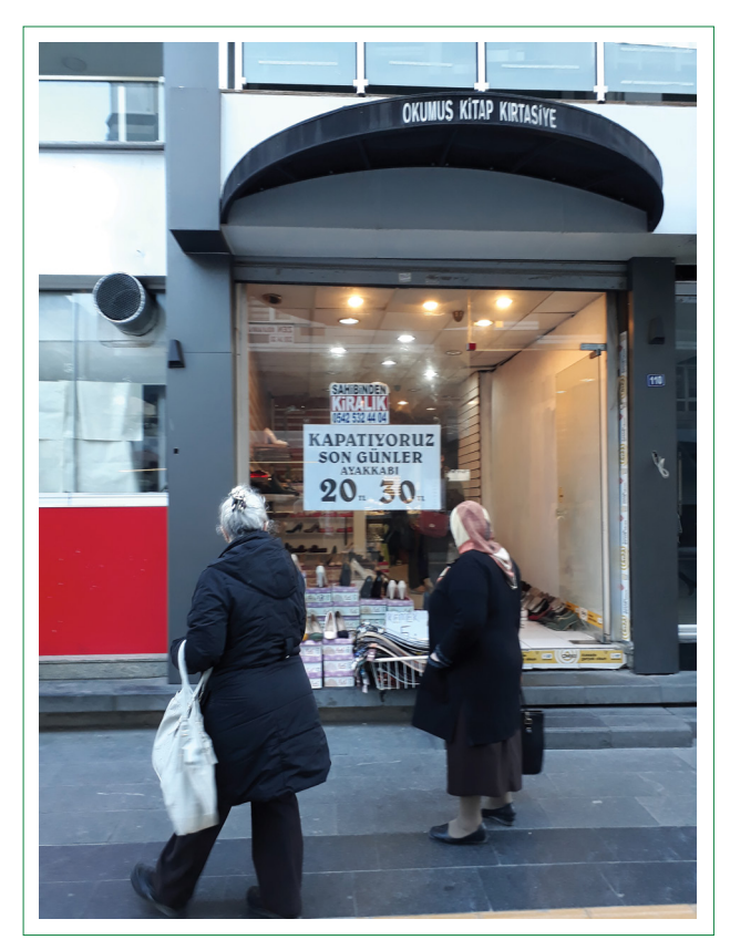
Figure 4. Shop closures: Shoes for 20-30 Turkish Liras!

An optician (G7), who acknowledged Çiftlik as the high street of Samsun, chose to search for a location on Çiftlik for her business in the mid-2000s, despite higher store rents. She reckoned that her shop would appeal to more people on Çiftlik Street. This suggests that Çiftlik Street had come to