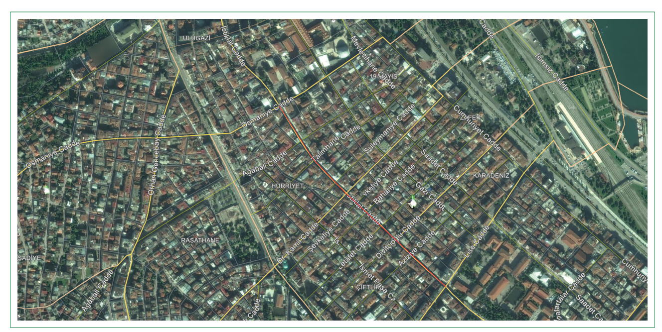
Figure 2. Çiftlik Street on the map (Source: İlkadım Belediyesi city guide).

A record and second-hand book seller (GII), whose shop was located on a side street under Çiftlik before he closed recently due to the COVID-19 pandemic, recalled the street of his youth as a place for socializing with friends. He stated: "We spent our time here, you see. We toured around this street from morning to evening. (...) Maybe we went to the sea on the weekends, but if not, we would be here again." A similar perception and use of the street seem to continue for young men today (Fig. 3). His description of the old Çiftlik Street as a meeting and socialization point counters local shopkeepers' argument that the pedestrianization attracted non-consumers to the street. Hubbard (2017, p. 50) describes these populations who spend time in the shopping streets and malls without consuming anything as "non-consumers". Yet this shopkeeper's comment suggests that 'undesirable' bystanders might have already been at Çiftlik Street before pedestrianization, but they were not as visible because a smaller population lived under better living conditions at the time. One may argue that they became more numerous and more visible with the worsening economy and the increase in unemployment. Moreover, they are easily identified due to heightened surveillance in consumption spaces nowadays.