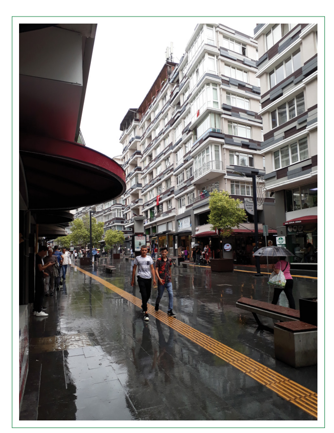
Figure 3. Today's non-consumers, walking on Çiftlik on a rainy day (Photo by author).

Regarding Samsun's past productivity and employability, the baker (G9) also recalled that "State Hydraulic Works was there. Everyone went (to work) and returned on foot. TEKEL factory used to operate. For example, whoever quitted TEKEL or State Hydraulic Works (in the evening) toured the street once or twice, met someone, their friends. (...) It (Çiftlik) was a nice place to socialize." His emphasis of Çiftlik, being a social space, even if it was not pedestrianized,