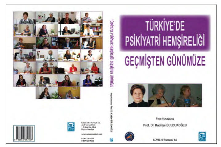
Figure 4. "Psychiatric Nursing in Türkiye: From Past to Present" Booklet Cover.

One challenge that needed to be overcome was the fact that the participants consisted of individuals working in different