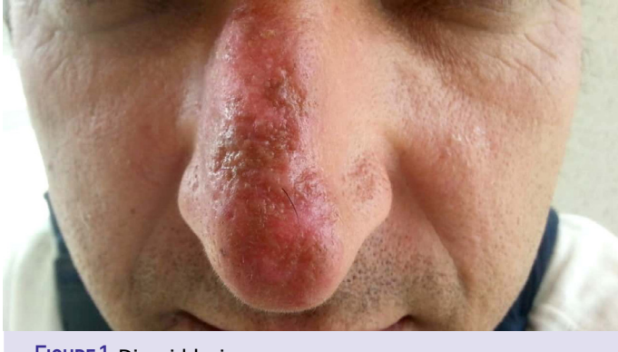
FIGURE 1. Discoid lesions.

A skin biopsy was performed and mononuclear inflammatory cell infiltration around the hair follicles on the dermis and increased mucin in the dermal papilla were seen (Fig. 3). After a diagnosis of ankylosing spondylitis and discoid lupus, 40 mg/2 weeks subcutaneously adalimumab, 400 mg/day hydroxychloroquine and topical tacrolimus were started. Using a high factor protective sun cream was recommended. In the followup, the clinical symptoms of AS were significantly improved.