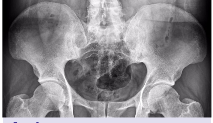
FIGURE 2. Bilateral sacroiliitis.