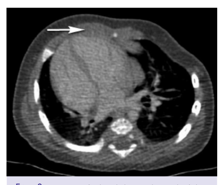
FIGURE 3. Asymmetry of right-sided pectoralis muscles (white arrow) with the absence of left pectoralis major and minor.

medical history, his mother had primary antiphospholipid syndrome (APS) and had four intrauterine exitus. There was no family history of similar complaints or findings.