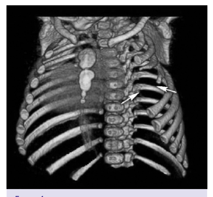
FIGURE 4. 3D-volume-rendered computed tomography showing hypoplasia of left anterior ribs (white arrow).

Based on these clinical and radiological findings, the diagnosis of Poland's syndrome was established.