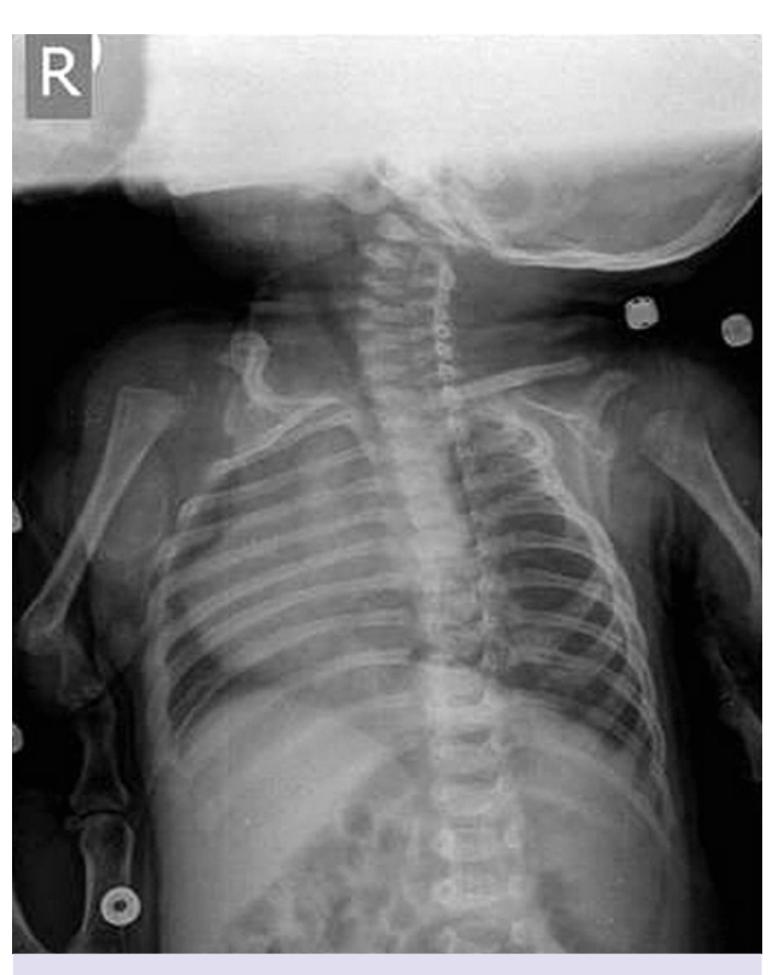
FIGURE 2. Chest X-ray demonstrating dextrocardia and leftsided chest wall deformities.

mities were detected (Fig. 2). Transthoracic echocardiography showed dextrocardia with suspicious connection of right pulmonary veins. Computed tomography (CT) of the chest was performed to exclude anomalies of pulmonary vein connections. An axial chest CT confirmed dextrocardia and demonstrated that right heart chambers were positioned posteriorly, left heart chambers anteriorly, and descending aorta was located on the left with normally connected vascular structures. There was asymmetry of the right-sided pectoralis muscles (white arrow) (Fig. 3). Hypoplasia of left-sided anterior ribs was demonstrated with a 3D-volume rendered CT scan (Fig. 4). Hypoplasia of the left pectoralis muscle was confirmed by ultrasonography (Fig. 5). The renal and testes ultrasonographic examination excluded other anomalies that can occur in Poland's syndrome, such as renal aplasia or hypoplasia and undescended testes. Further systemic evaluation, including examination of hands, lower limbs, hair, and nails did not show other anomalies. The neurological examination and transcranial ultrasonography were normal. In his familial