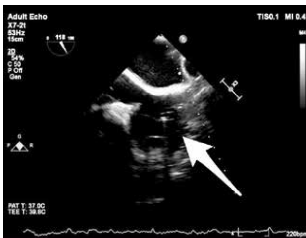
FIGURE 1. A highly mobile structure was shown in the right atrium (arrow) on echocardiography.

In the current case, echocardiography showed a highly mobile structure, the Chiari network, mimicking a right atrial thrombus attached in the