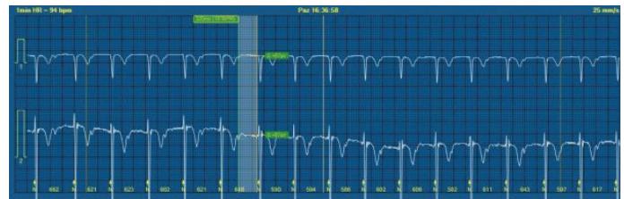
FIGURE 3. First-degree atrioventricular block pattern in was revealed in 24-h rhythm Holter recordings.

One week after discontinuation of anti-inflammatory treatment, PR interval prolonged to 220 ms again meanwhile acute phase reactants were elevated. These findings were explained with ARF relapse. Anti-inflammatory therapy was resumed and administered for 3 weeks. PR interval returned to normal once acute phase reactants were normal. This case has received penicillin prophylaxis since he was diagnosed with ARF and his outpatient visits have been made regularly for 6 months. During follow-up, dysrhythmias was not seen again neither on ECG nor on 24-h rhythm Holter recordings. Informed consent was obtained from patient and family for this study.