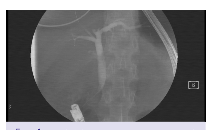
FIGURE 1. Normal cholangiogram image in a patient with billroth II gastric resection (using standard side-view duo-denoscope).

The average total operation time in the initial session was 92 minutes (range: 41–122 minutes), while the average time necessary to reach the ampulla or orifice was 41.7 minutes (range: 12–73 minutes). Fluoroscopic images of patients with BII taken during ERCP using a