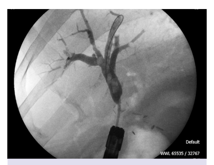
FIGURE 4. Cholangiography image in a patient with Hepaticojejunostomy who underwent liver resection for cholangiocarcinoma (procedure was performed with DBE, using accessories longer than standard ones).

The DBE reached the ampulla in 30 patients (96.8%) and cannulation of the common bile duct was successful in all but 3 (87.1%). The ampullary orifice was covered with a tumor in 1 patient. When selective biliary cannulation failed in this patient (3.2%), PTC and drainage proved successful. Afferent loop perforation was encountered in 1 patient, which was recognized during the procedure.