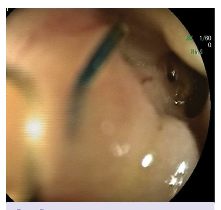
FIGURE 5. Endoscopic view of narrowed hepaticojejunostomy anastomosis opening (image was taken with DBE).

Two patients were treated with the PTC-rendezvous method, followed by trans-ampullary access.