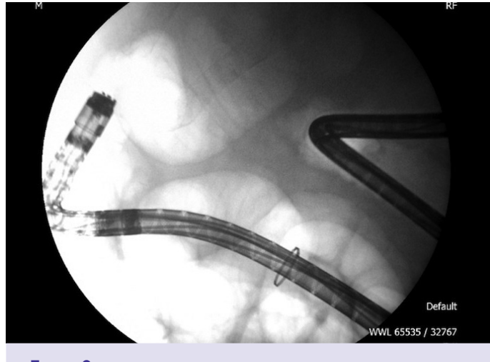
FIGURE 3. During DBE-ERCP procedure, DBE is advanced in the surgically modified small intestine (fluoroscopic view). DBE: Double balloon enteroscopy; ERCP: Endoscopic retrograde cholangiopancreatography; DBE-ERCP: ERCP with DBE.

perforation that developed during the DBE-ERCP procedure. This patient was referred to surgery and subsequently recovered uneventfully.