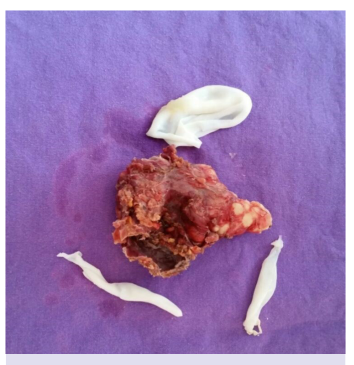
FIGURE 4. Surgical materials removed during the operation.

the hepatic sinusoid or pulmonary capillary barriers via blood and lymph; and pass into the systemic circulation, where they can affect all organs and structures [1, 2].