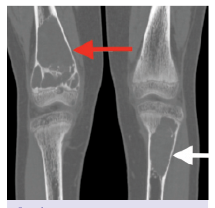
FIGURE 2. A bone lesion measuring 66 \times 30 mm (white arrow) in the proximal metaphysis of the left tibia and the other one measuring 80 \times 36 mm in the distal metaphysis of the right femur (red arrow) are observed.