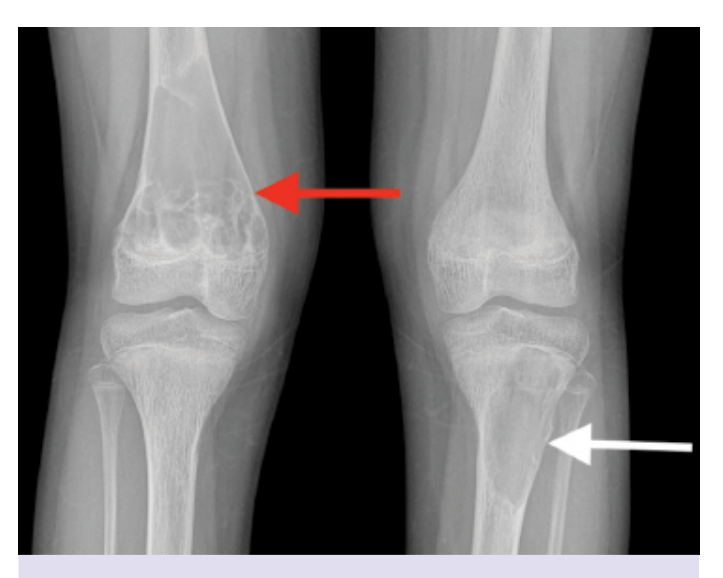
FIGURE 1 . A bone lesion measuring 71 \times 30 mm (white arrow) on the proximal metaphysis of the left tibia and the other one measuring 87 \times 44 mm in size (red arrow) in the distal metaphysis of the right femur are observed.