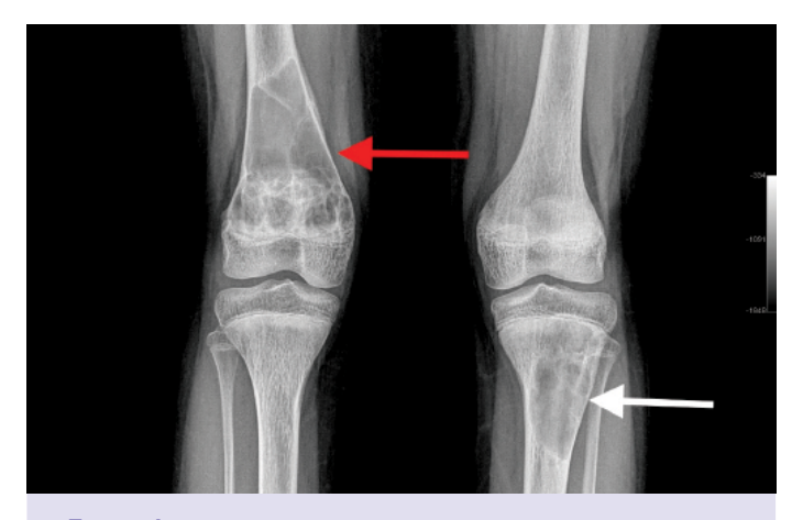
FIGURE 4. Decreases in the dimensions of the Brown tumors localized in the tibia and femur are observed on the control knee radiograms.

adenoma. The patient was diagnosed with parathyroid adenoma and Brown tumor developed secondary to parathyroid adenoma.