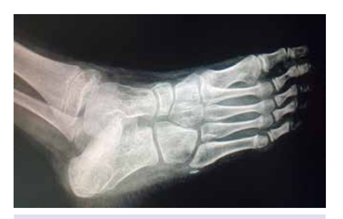
FIGURE 2. Spotted osteoporosis in calcaneus and navicular bones.

as the presence of tibiotalar-diffused intra-articular effusion, fluid in most of the intertarsal joints and surrounding peroneal tendons and tibialis posterior tendon consistent with tendinitis (Figures 3, 4). Diagnosed with CRPS Type 1 secondary to trauma, analgesic treatment and contrast bath were recommended. Patient next presented at outpatient clinic with non-regressed complaints. There was morning stiffness for about 5 to 10 minutes and she limped throughout the day. There were no symptoms of fever, rash, abdominal