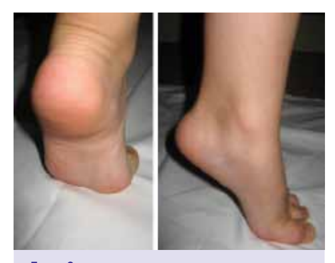
FIGURE 2. Tiptoe test. While raising up on tiptoe, reconstruction of the medial longitudinal arch collapsed during weight-bearing is observed.