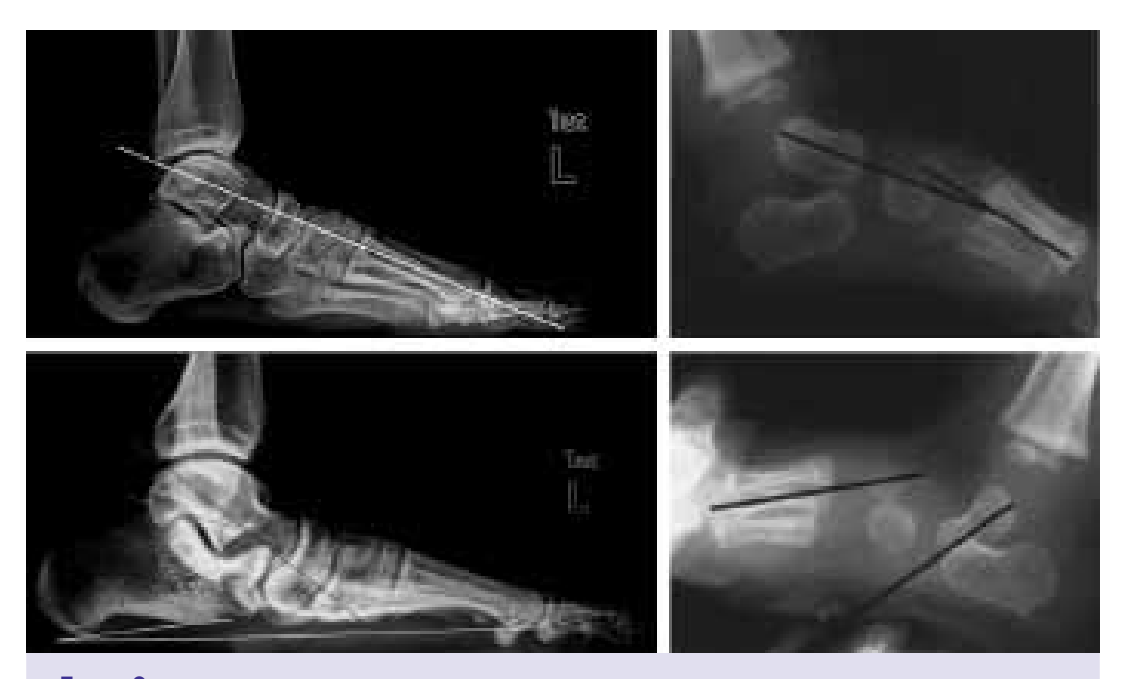
FIGURE 8. Normal, and deformed Meary angle. Lateral radiograms obtained while the patient is standing on foot, the angle between longitudinal axes between the talus, and the first metatars is called Meary angle. Normally these two axes are in alignment.

calcaneal angle should range between 15°, and 35°. An angle over 35° indicates hindfoot valgus. On lateral radiograms, talocalcaneal angle should vary