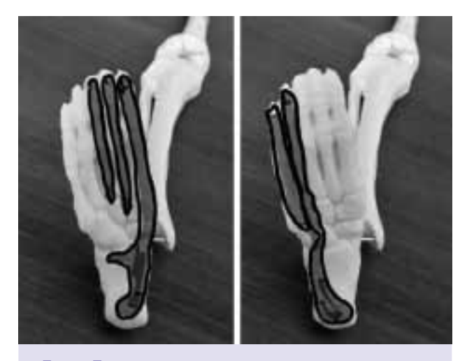
FIGURE 5. Weight- shifting pattern. During normal walking weight-bearing pattern passing through lateral edge of the foot, shifts to the medial side, and media structures rest on the floor.

When the foot is in supination, bones of the midfoot are locked, and lose much of their capacity to move. However joints of the pronated foot become more mobile. During weight-bearing, eversion of the heel, and abduction of the forefoot cause collapse of the midfoot, shortening of the longitudinal arch , and consequently talar head, and navicular tuberosity rest on the floor, and bears the whole weight. With time Achilles tendon shortens, and everts the foot with potential worsening of the deformity, and development of tendon contracture. Many techniques have been used to identify, and define medial longitudinal arch of the foot including radiological imaging modalities, podoscopic systems which employ mirror to show the contact area beneath the foot, whole toeless footprint analysis, arch height, and foot plantar pressure measurements To obtain quantitative data, Clarke angle, Chippaux-Smirak Index (CSI), Staheli arch index have been defined. Among them CSI [10, 11] has been reported to have a predictive value above 90 percent [12]. CSI is the ratio between the widest (segment a) and the narrowest (segment b) areas with borders passing through metatarsal heads as estimated from podographic measurements of footprints The classification of feet based on b/a ratio