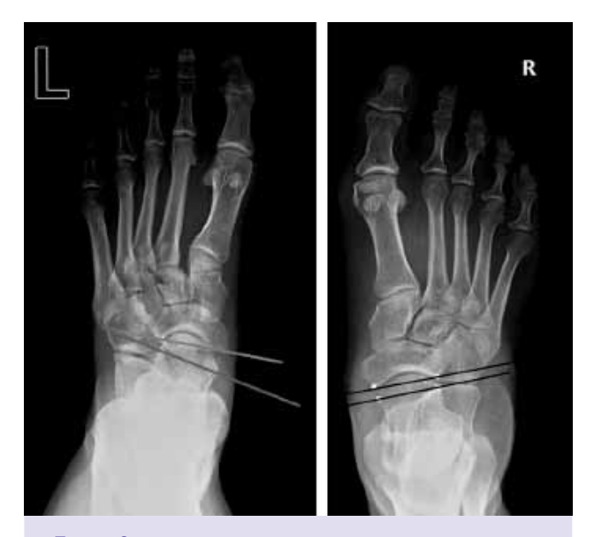
FIGURE 9 . Normal, and deformed talonavicular grasping angle. On dorsolateral radiograms obtained while the patient is standing on foot, the angle formed by the bisection of the antero-medial, and the anterior-lateral extremes of the talar head, and the bisection of the proxiimal articular surface of the navicular. If it is more than 7 degrees, then it indicates presence of a lateral talar subluxation.

exceed 7 degrees (Figure 9). On lateral radiograms of the patients standing on feet with shorter medial longitudinal arches, talus assumes a more vertical, while calcaneus, and metatarses take a more horizontal position. In cases requiring further examinations, on oblique radiograms or Harris radiograms (radiograms of the posterior aspect of the foot obtained from a 45° angle of projection) tarsal coalition, vertical talus, talipes calcaneovalgus, accessory navicular bone can be visualized.