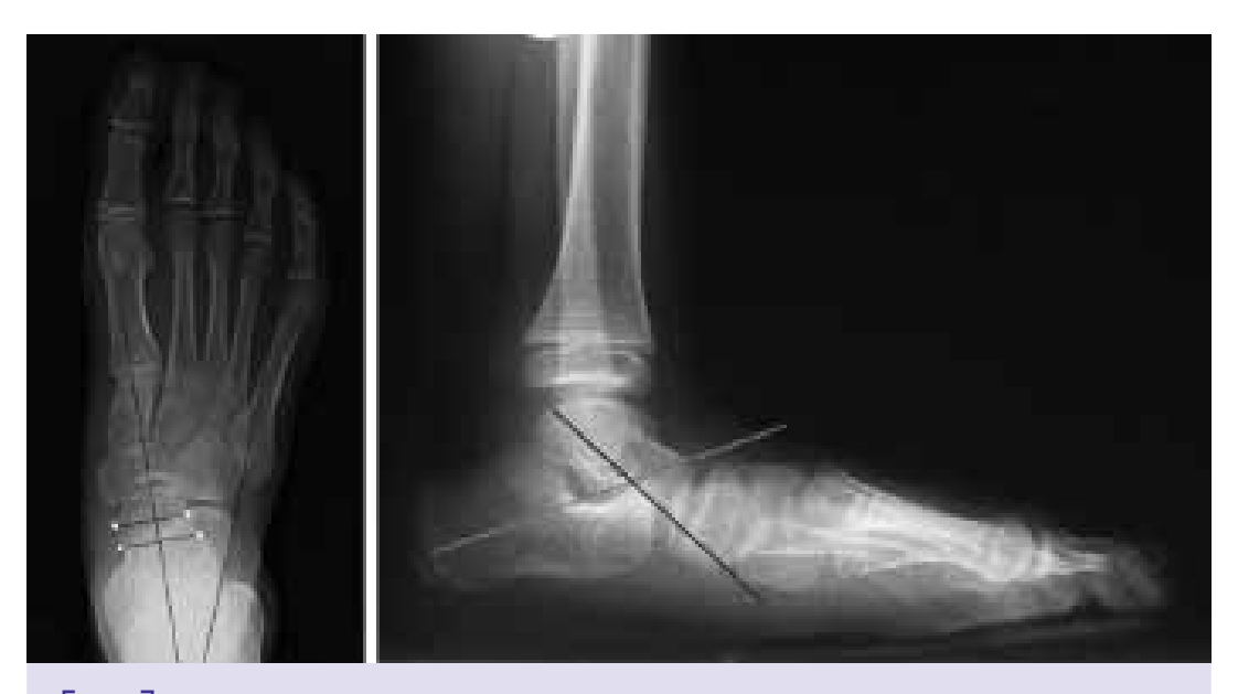
FIGURE 7. Anterior and lateral talocalcaneal angle. On anteroposterior radiograms the angle between the longitudinal axes of the talar, and anterior talocalcaneal joints (Kite angle). It normally measures between 15, and 35 degrees which decreases in varus foot, and increases in hindfoot valgus. On lateral radiograms the angle between longitudinal axes of talus, and calcaneus (plantar surface axis of the calcaneus) is termed as lateral talocalcaneal angle.