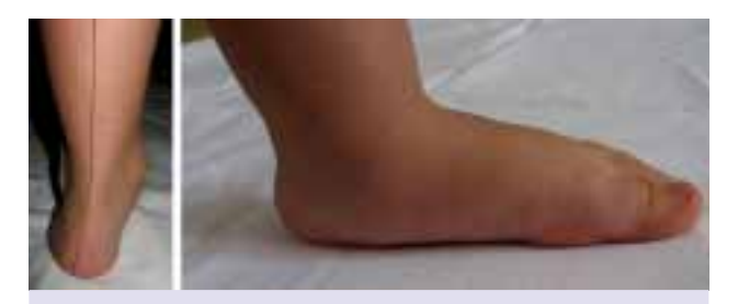
FIGURE 1 . Collapse of the weight-bearing foot. During weight-bearing, disappearance of the medial longitudinal arch of the foot is seen. On posterior view, angling of the Achilles tendon (hindfoot valgus) is observed.