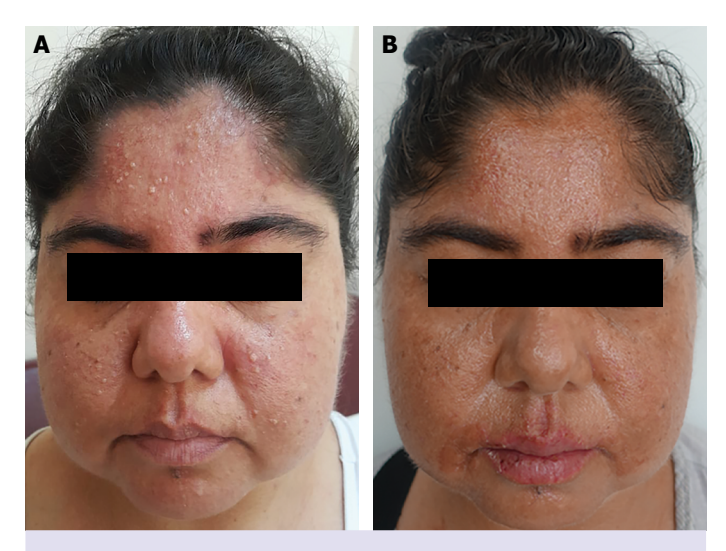
FIGURE 1. (A) A large number of yellow-colored papules on the forehead, cheek, and chin. (B) Hyperproliferation of the sebaceous glands (HEx4).

urine, 6 mg/day methylprednisolone was used. She had been receiving cyclosporine and steroid treatment for 25 years in reduced doses. The lesions, which started in the fifth year of treatment, had gradually increased over the years. Dermatological examination showed that there were a large number of yellow-colored papules on the forehead, cheek, and chin, ranging from 1-4 mm (Fig. 1A). Histopathological examination of the punch biopsy on the forehead of the patient revealed hyperproliferation of the sebaceous glands (Fig. 1B). The patient was diagnosed with sebaceous hyperplasia and systemic isotretinoin treatment was started at 40 mg/day (0.6 mg/kg/day). The patient continued cyclosporine treatment at the same dose. After a twomonth treatment, the lesions on the face of the patient showed near-total regression (Fig. 2) The drug dose was then reduced to 20 mg/day (0.3 mg/kg/day) and continued for four months. No side effects were seen except mild cheilitis. One year after discontinuation of the therapy, no recurrence was observed. Patient's consent was obtained for this study.