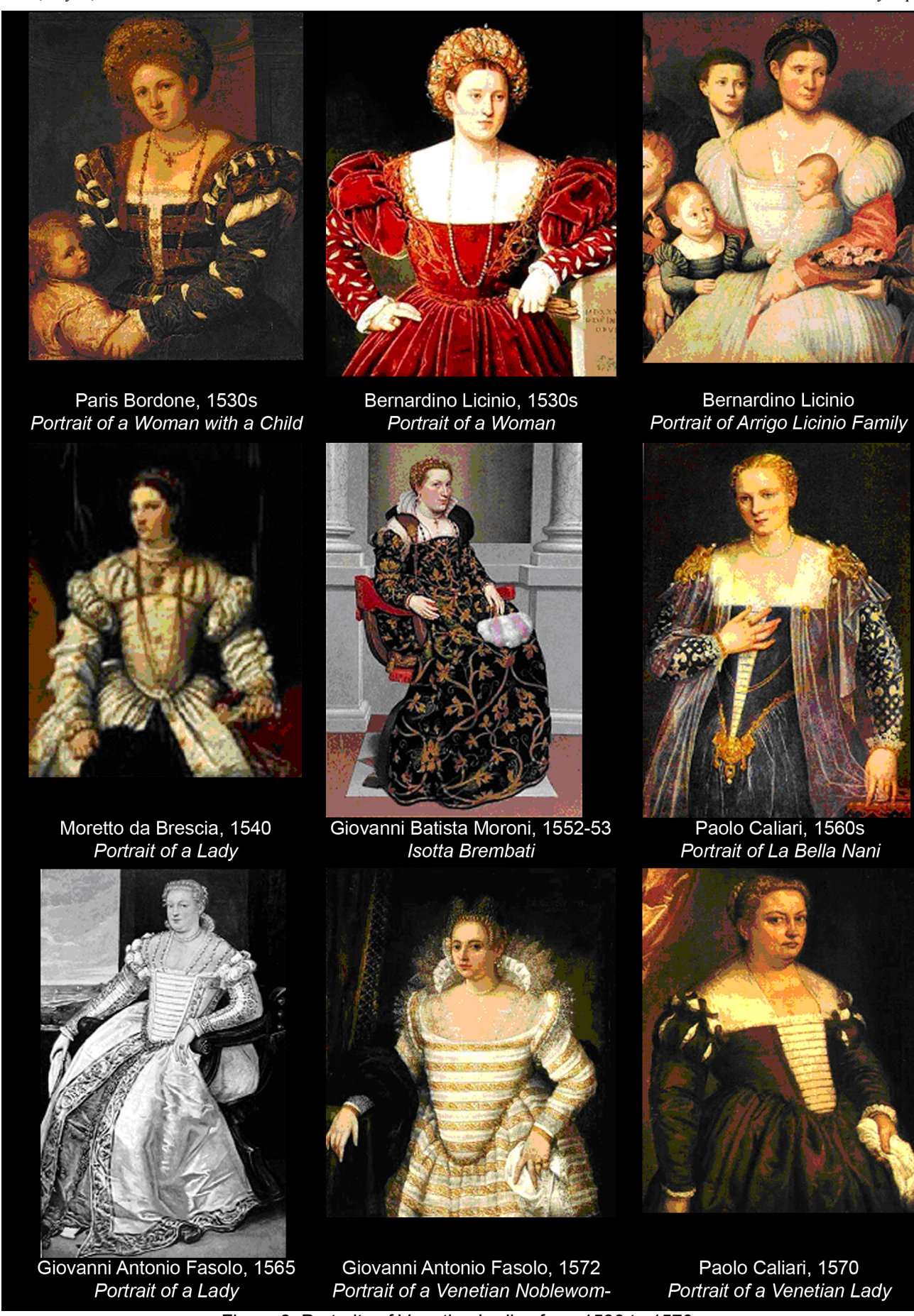
Figure 3. Portraits of Venetian Ladies from 1530 to 1570