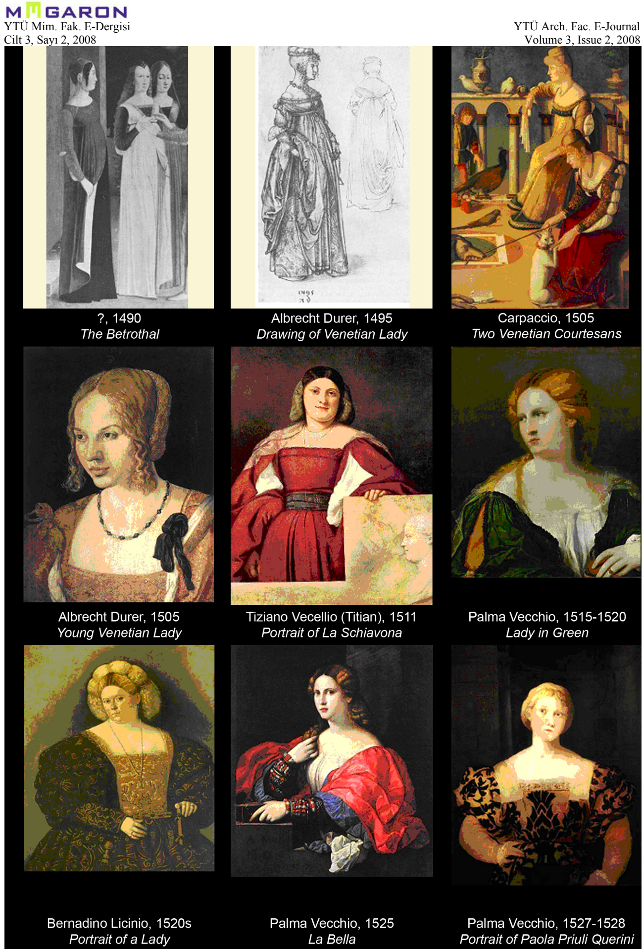
Figure 2. Portraits of Venetian Ladies from 1490 to 1527