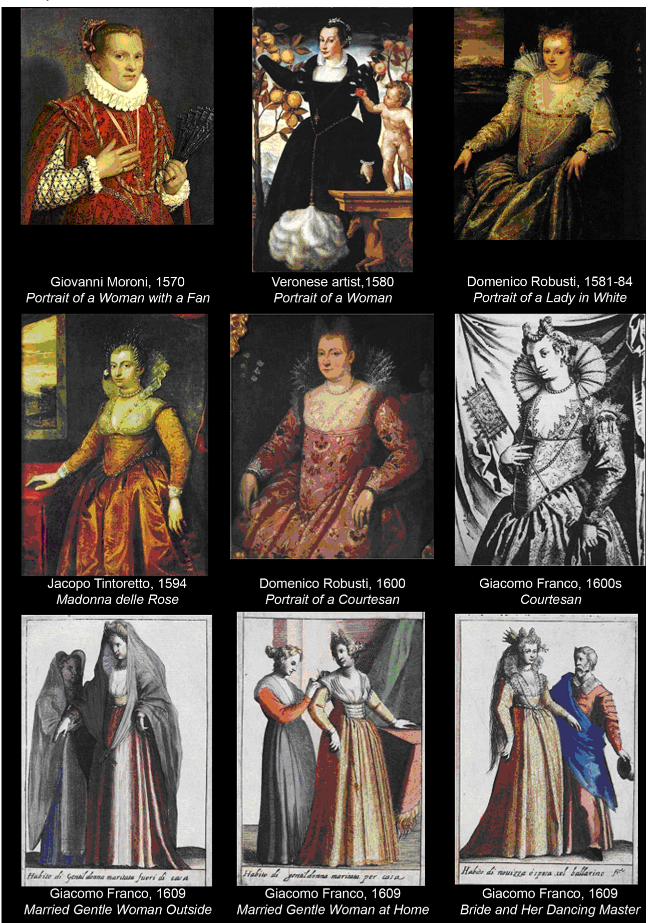
Figure 4. Portraits of Venetian Ladies from 1570 to 1609