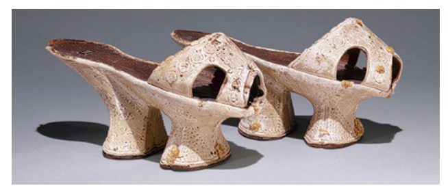
Figure 1. Venetian Chopines

highly visible public profile. However, in sixteenth-century height was associated with the wearer's level of nobility and grandeur." [27]