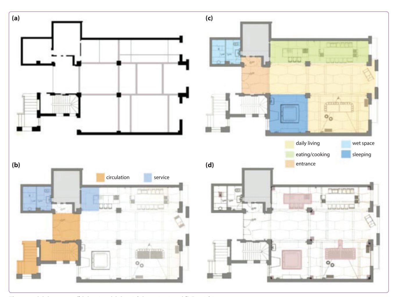
Figure 7. (a) Structure; (b) Service; (c) Spatial Organization; (d) Furnishing. (MIsIr Loft, 2004. Tasarım Dergisi, vol.147, pp.132-139. Figures of case studies' analyses (Fig. 3-8) are edited by the authors. Last accessed date is 15.08.15 for all web sources.)

can take place in one space without partitions. As it shown in images, bathroom has designed almost out of flat plan. Cooking and eating space was also being used as kitchen in old usage of flat. There is no restriction to use cooking space any time differently because it has changeable and adaptable facilities.