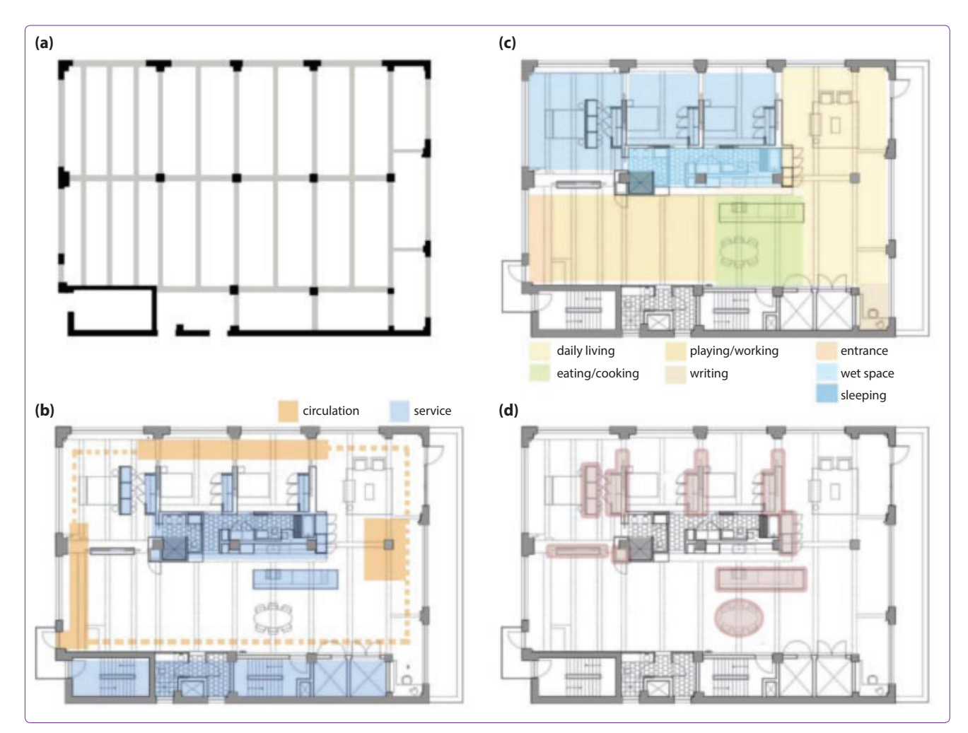
Figure 4. (a) Structure; (b) Service; (c) Spatial Organization; (d) Furnishing. (http://re4a.com/projects/loft-of-frank-amy/)

Structure: As shown in images, the structural system is consisted of reinforced concrete columns and beams and two service cores (vertical circulation units enclosed by reinforced concrete load-bearing walls). The system is located on the periphery of building plan. During transformation, concrete framed structure has completely preserved and the form and plan of the existing structure provides many advantages for flexible using (Figure 5a). Besides the structure, determining