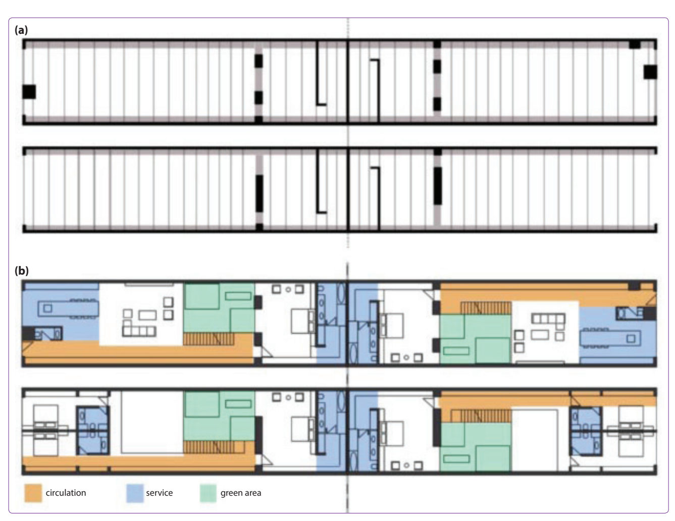
Figure 6. Loft flat named Type 3 (a) Structure; (b) Service. (http://www.archdaily.com/213866/goksu-rope-factory-lofts-suyabatmaz-demirel-architects/).

to their wishes by the way of these pieces. Apart from the structure, all the main area is open and indeterminate, especially on the entrance floor. In flat named type 3, the sleeping and daily living area are separated from each other prominently. Daily living area has cooking, relaxing, sitting, reading and various activity areas without partitions. So they give a chance to users to adapt this place according to their wishes. They can use dividers to unite or divide spaces.