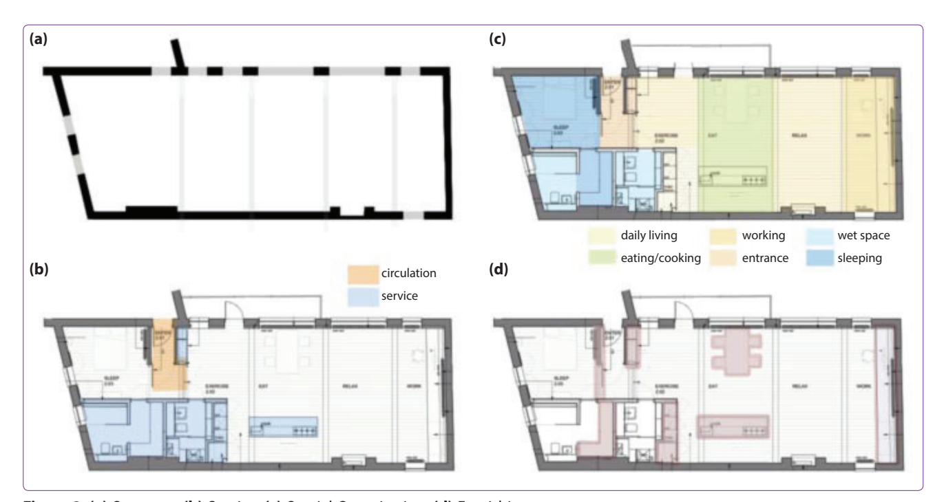
Figure 2. (a) Structure; (b) Service; (c) Spatial Organization; (d) Furnishing.

There are few unused small-scale warehouses in Turkey for using them with original loft sense, while big-scale stores are considered appropriate for tourism purposes. At the beginning of the 20<sup>th</sup> century, number of industrial structures existed in İstanbul reduced from 256 to 42 because of various reasons.<sup>24</sup> When transformation gained importance in the 21<sup>th</sup> century, fortunately, the values of these remained structures were appreciated and some of them were registered.