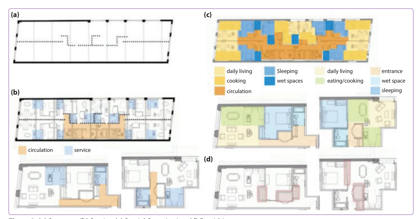
Figure 3. (a) Structure; (b) Service; (c) Spatial Organization; (d) Furnishing. (http://www.archdaily.com/479128/95-king-street-east-studios-and-lofts-thiercurran-architects/)

Service: The service spaces of the building are located adjacent to a longitudinal exterior wall, which provides the vertical circulation in the building. And the service spaces of the loft, which includes the bathrooms and the kitchen, are placed around the structural axis in the middle of the apartment and also in between the building's service spaces. The service space of the loft, which is around the structural axis in the middle of the apartment, separates the public and