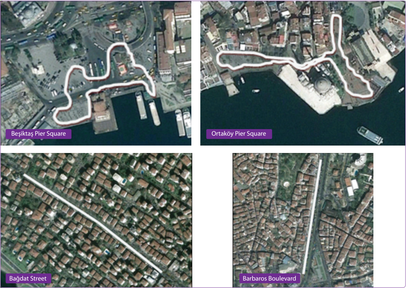
Figure 2. Routes of the soundwalks in the selected areas.

The survey form is composed of two parts; a questionnaire part where the general information about sound environment with the soundmarks and their pleasantness are investigated; and a semantic differential test where the quality of sound environment is analyzed. The questionnaire part consisted of 16 questions on the categories about personal information, area usage, congruity of the physical environment to the respondents expectations (general judgment, listing the several environmental factors -given as landscape, scenery, vegetation, cleanliness, safety, clean air, silence, odour, functional structure, location, ratio between constructed and circulation/recreational areas, building heights, historical/touristic value, sales approach, social aspects, entertainment structure-; according to priority on the perception of area and their congruity to the respondents expectations), sound environment evaluation of the area (determination of soundmark/s of the area and the satisfaction from the soundmark/s).