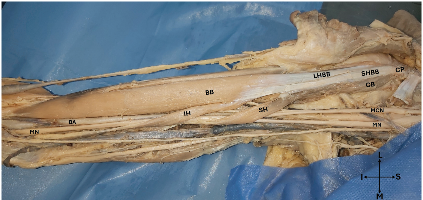
Figure 2. The CB and SHBB muscles originate from the CP, as shown in the figure. The CB muscle is located medial to the SHBB. The MCN did not penetrate the CB. Instead, the MCN passed beneath the SH, providing muscular branches to the BB. The MN traverses beneath the SH and IH. The SH separated from the SHBB at the proximal part of the humerus, corresponding to the insertion point of the CB. On the other hand, the IH separates from the body of the BB in the upper-middle part of the humerus.

BA: Brachial artery, BB: Biceps brachii, CB: Coracobrachialis muscle, CP: Coracoid process, IH: Inferior head of the biceps brachii, LHBB: Long head of the biceps brachii, MCN: Muscular nerve, MN: Median nerve, SH: Superior head of the biceps brachii, SHBB: Short head of the biceps brachii. S: Superior, I: Inferior, M: Medial, L: Lateral