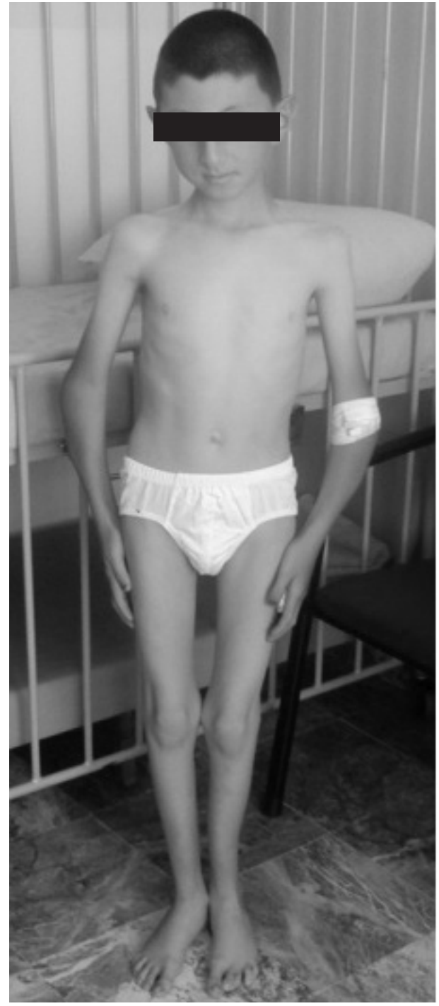
Figure 1. Clinical appearance of the patient with osteogenesis imperfecta and parsiyel trizomi 20p.

The hospital Ethical Committee approved the human study. We obtained written informed consent from the parents of the patient. Because the patient presented as a child with relatively minor symptoms, diagnosis of Type IA OI (the mildest form) was established.