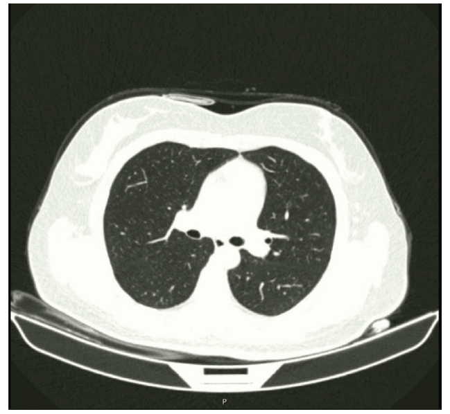
Figure 2. Toraks ct of first hospitalization day.

not been seen three days ago. Changes in the patient's lung imaging within three days are shown in Figures 2, and 3. Scanning showed that the main pulmonary artery and its branches were free of embolism. Bilateral pleural effusion and 5 cm deep free fluid between intestinal loops in abdominal ultrasound imaging were reported as pathological results. On the third day of hospitalization, the antibacterial treatment with meropenem, linezolid, and clarithromycin was rearranged and ordered. Repetitive Polymerase Chain Reaction (PCR) tests for SARS- CoV-2