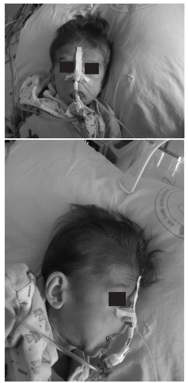
Figure 1. Present case at the age of 4 months.