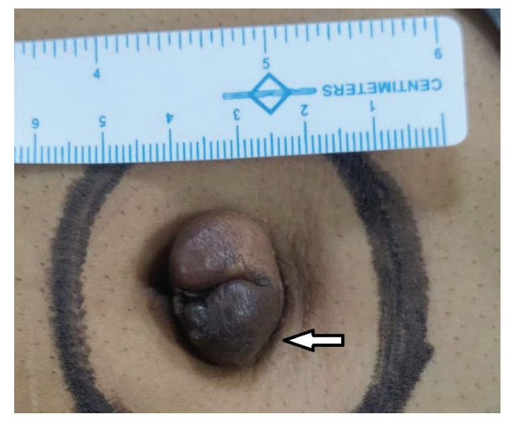
Figure 1. Macroscopic presentation of the 2×1.5 cm size and hyperpigmented firm lesion of umbilical endometriosis, marked by a white arrow.

General examination revealed no abnormality, except for mild hirsutism. Local examination revealed a brownishblack nodule of approximately 2×1.5 cm on the umbilicus.