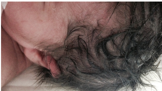
Figure 1. Newborn with the encephalocele.

During sonographic examination a single viable male fetus appropriate for 38 weeks of gestation was detected. In the calvarium of the fetus a 3x4 cm mass was also detected protruding from the left temporo-parietal region. Small amount of brain tissue was identified in this mass. Any fetal extracranial congenital malformations were not detected. Diagnosis of a temporo-parietal encephalocele was made. Our patient did not undergo any ultrasonographic exam up to 28 weeks of gestation. The patient confessed that she had been referred to further investigations in her previous prenatal visit but she had refused it, fearing from coming across with the suggestion of termination. During the evaluation process, fetal