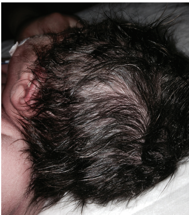
Figure 2. Encephalocele from the lateral view.

distress characterized by severe decelerations of fetal heart beats was noticed. An emergency caesarean section was performed. The baby was born with a 3x4 centimeter (cm) temporo-parietal encephalocele. The lesion was covered with normal skin (Figure 1 and 2). The Apgar scores were 7 and 9 at 1 st and 5 th minutes respectively.