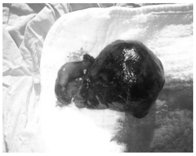
Figure 2. Macroscopic view, gangrenous enlarged ovary and fallopian tube.

under general anaesthesia through pfannenstiel incision. Minimal blood-stained peritoneal fluid was noted in the abdomen. The right adnexa was localized in the pouch of Douglas and measured about 8x8 cm in diameter. It was gangrenous and had undergone torsion three times around its pedicle. The right fallopian tube was hydropic.