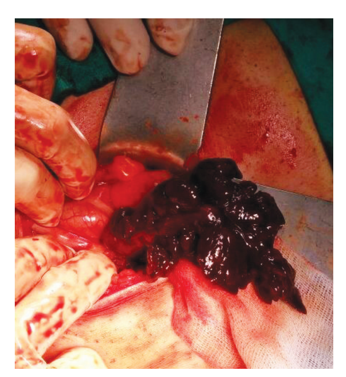
Figure 2. This peroperative image shows that the appendix is edematous and there is intense hematoma in its root, wall and the mesoappendix.

detected, but the diameter of appendix was 11 mm and there was increased density in periappendiceal mesentery, which was interpreted as acute appendicitis (Figure 1). Ninety minutes after admission to the hospital, the patient was urgently taken to the operation. A McBurney's incision was performed, and intraabdominal organs were examined in terms of trauma. Appendix was edematous and non-per-