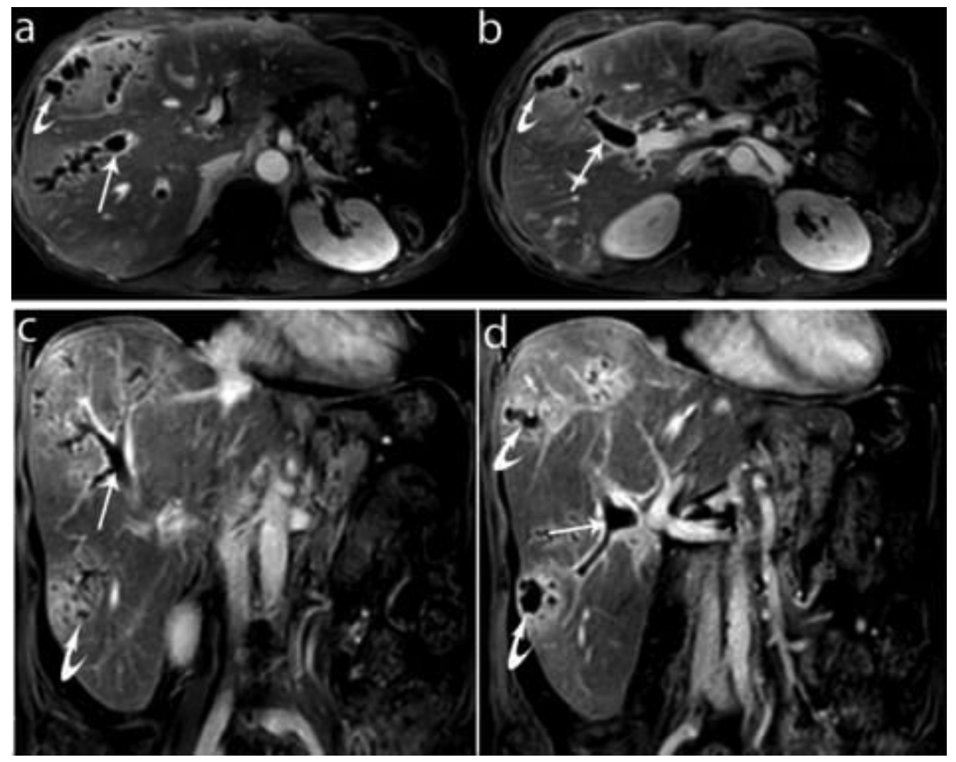
Figure 2. Axial (a, b) and coronal (c, d) contrast-enhanced T1-weighted MR images show multiple abscesses (curved arrows) and pylephlebitis in the intrahepatic branches of the main portal vein (arrows), which should not be confused as dilated intrahepatic bile ducts. Notice the normal appearance of main portal vein (arrowheads).

therapy and radiotherapy were performed. Adjuvant chemotherapy with gemcitabine plus cisplatin for 4 cycles were completed in November 2017. Her physical examination revealed right upper quadrant tenderness and ascites. Laboratory studies showed an increased C-reactive protein level of 107.67 mg/L (normal range, 0-8 mg/L), leukocytosis with a white blood cell count of 11.31 \times 10^{9} /L (normal range, [4.2-10.2]×10<sup>9</sup>/L), low platelet count of 54 \times 10^{9} /L (normal range, 142-424×10<sup>9</sup>/L). Liver enzyme levels were also elevated including aspartate aminotransferase (43 U/L: normal range <32 U/L), alkaline phos-