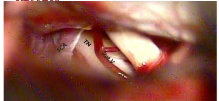
Figure 1: Superior cerebellar artery (SCA) and petrosal vein (Pet.V) attached to the trigeminal nerve (TN)