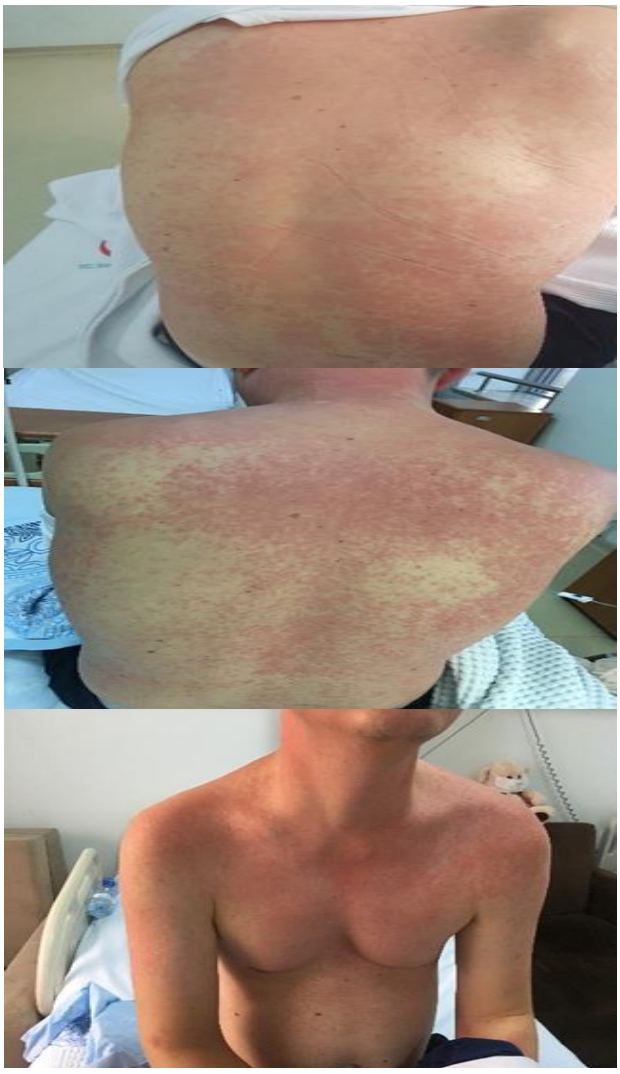
Figure 2. Back and chest skin lesions

Cranial diffusion there was no signal change in the intracranial neural parenchyma in favor of acute ischemia in MR imaging. Ceftriakson and vancomycin (continued daptomycin) intranenous (IV) treatments were completed on 14th day and her fever was 36.5 °C on the 4th day. Acyclovir treatment and antiepileptic treatment were arranged as tablets and discharged from the service. One day after his discharge, the patient was hospitalized at the third week of antibiotherapy and antiepileptic treatment with diffuse skin rash and periorbital edema. (Figure 2-3).