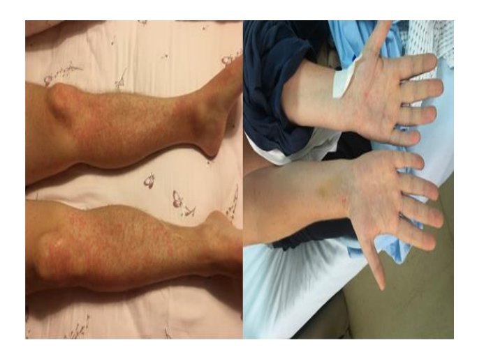
Figure 3. Skin lesions on the legs and arms