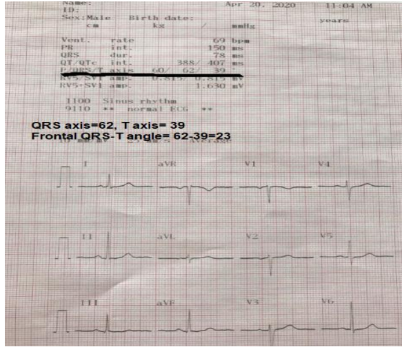
Figure 2. An example of the measurement of frontal QRS-T angle from automatic report of 12-lead surface electrocardiography.

Figure 1. Electrocardiographic parameters measured when assessing the QT interval and Tp-e interval.