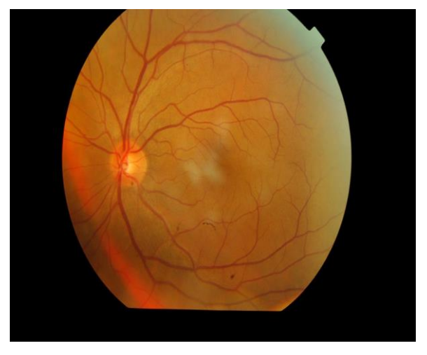
Figure-1: Preoperative image sample of the fundus