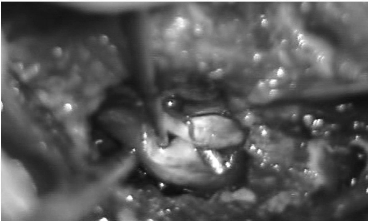
Figure 3. Intraoperative view of the accessory nerves.

Urinary incontinence was observed in three of the patients who had an accessory nerve root and in 13 of the patients, who did not. Cauda equina findings were observed in five patients, who did not have accessory nerve root and in one patient with an accessory nerve root.