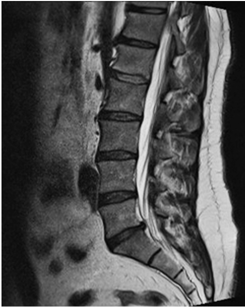
Figure 1. T2A sagittal MRI. L5-S1 lumbar disc herniation.