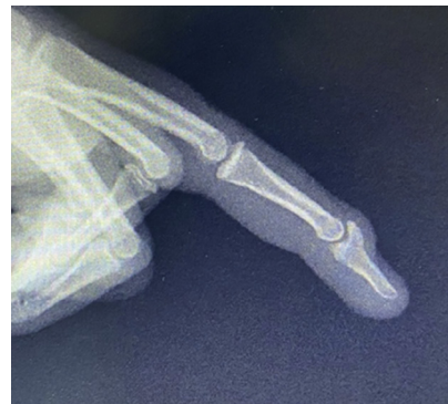
Figure 2. Mallet injury with complete union Lateral X-Ray.