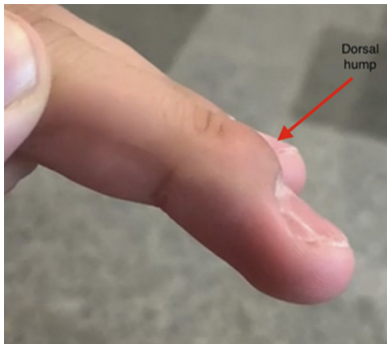
Figure 3. Clinical dorsal hump.