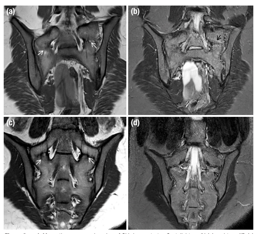
Figure 2. a–d. Magnetic resonance imaging of SIJ demonstrates Castellvi type IV (a) and type IIB (c) sacralizations (white arrows) on paracoronal T1-weighted images. Contrast-enhanced fat-saturated T1-weighted images (b, d) demonstrate bone marrow edema at both sides of sacralization (black arrows).

Accompanying prominent vascular structures occurred in 52 (41%) of the 127 patients with sacral defects and iliosacral complexes (Fig. 3).